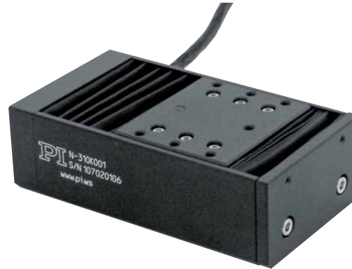
Translation stage with N-310 NEXACT® drive. The positioner offers 20 mm travel range with an encoder resolution of 25 nm