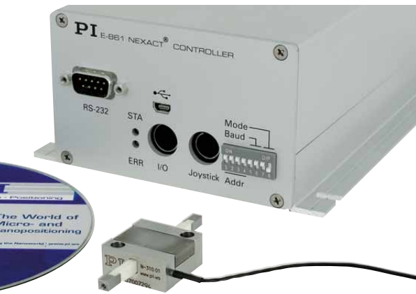
N-310 Actuator with E-861 Servo-Controller (integrated drive electronics)